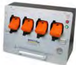
MGC Pump Clip Dock Wall Mount* Part# MGC-WMDOCK-PUMP High Pressure Part# MGC-WMDOCK-PUMP-HP