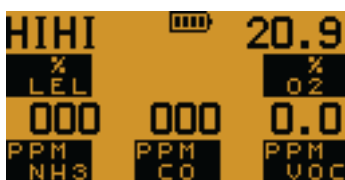
Display in alarm conditions