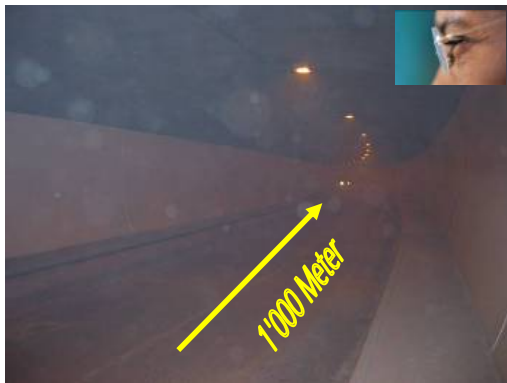
Picture: Decreasing visibility over distance

In tunnel ventilation, the extinction coefficient „K“ has become the customary measure for visibility. Most countries provide values for normal operation in their directives for the layout of tunnel ventilation. These lie typically at a value of K_{lim} = 0.005 \text{ m}^{-1} or 5mE/m (milli-extinction per metre). At a visibility of 12mE/m, the tunnel has to be closed for safety reasons.