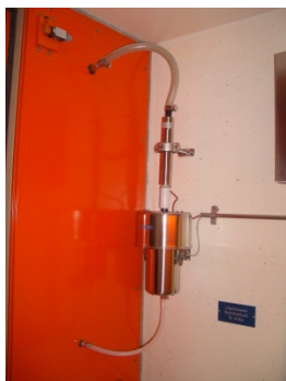
Picture: VisGuard Mini-extractive installed in an SOS-niche

The cost of energy for ventilation control is by far the largest proportion in the operating costs of a road tunnel. For the 17 kilometres of the Gotthard tunnel, the total yearly energy consumption amounts to approx. 14.5 Mio. Kwh. About 86% of the energy is consumed by the ventilation, while only 4% of the energy is used for the illumination. With the installation of the VisGuard, the ventilation can be controlled in such a manner that the ventilation can be substantially reduced or even completely turned off at times of little traffic while at the same time the contaminants are sufficiently eliminated and the visibility is guaranteed in accordance with the existing directives.