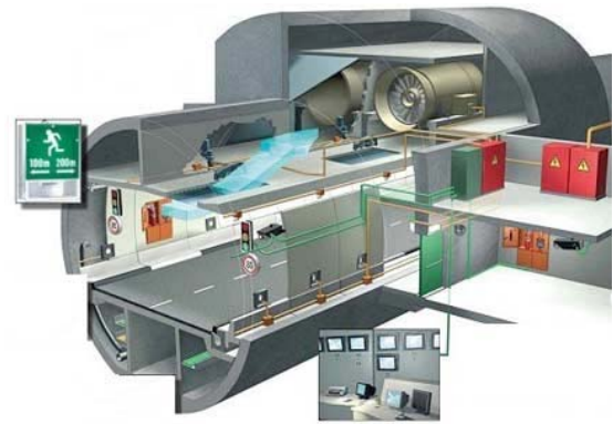
Picture: Section through a ventilation layout

High visibility in road tunnel tubes is an essential criterion for the layout of the ventilation system under normal traffic conditions, i.e. free-flowing, stop-and-go, congested traffic. A continuous assessment of the visibility serves as the main control variable for the correct and efficient operation of the tunnel ventilation during such traffic conditions. Visibility is impaired by particles resulting from combustion and by other particles. These other non-combustion particles originate from abrasion (brakes, tires) and re-suspension (swirling fine dust particles). During winter application of road salts also adds to the problem.