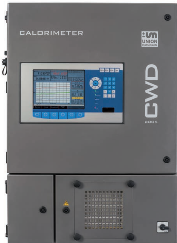
Figure 1: CWD2005

There is the option to handle several variable measuring ranges by just one device. In addition it is possible to measure even low calorific gases with the help of a carrier gas supply.