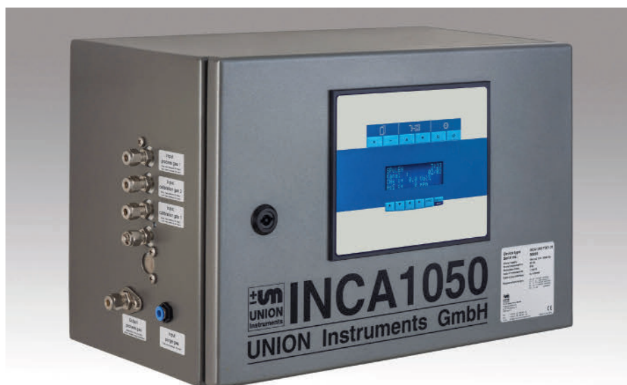
Figure 2: The INCA gas analyzers are extremely well-suited for determination of highly fluctuating concentrations of H 2 S, such as in digester gas

INCA offers different operating modes: continuous operation, gentle cycled operation with or without a change between sample gas and purging air, operation with changeover to up to ten sample gas streams, and most notably the patented sensors for robust H 2 S measurements over a long time period in the concentration range of a few ppm up to 10,000 ppm and higher.